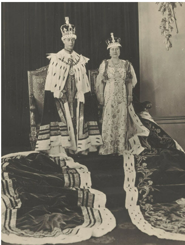
King George VI and Queen Elizabeth in their coronation robes, 1937