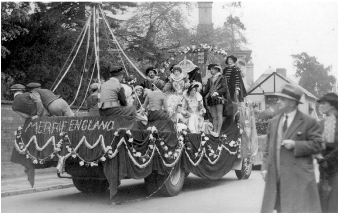
Decorated float in Coronation Celebration in Stratford upon Avon. 1937