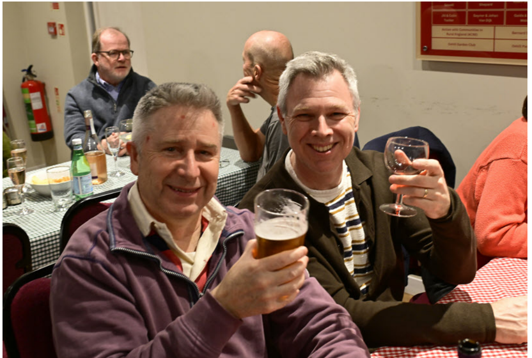
Quiz Night photos