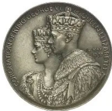
1937 Coronation Souvenir Programme (above) and medal (below).