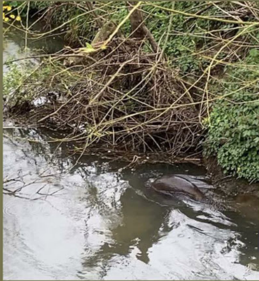
Facebook post on the OWLS page by Grenville Moore